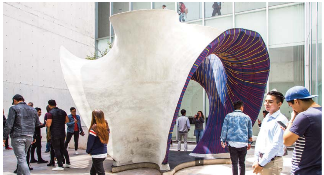
Figure 1. General view on the finished structure

KnitCandela is a thin, sinuous concrete shell built on an ultra-lightweight knitted formwork that was carried from Switzerland to Mexico in a suitcase!