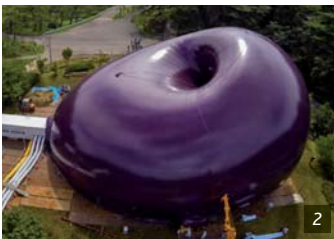
Figure 1. Visualisation Ark Nova © Anish Kapoor Figure 2. Ark Nova © Anish Kapoor

Architect Arata Isozaki wins the Pritzker Prize 2019 and with this he continues the tradition of Japanese prize winners such as Shigeru Ban (2014), Toyo Ito (2013) and Sanaa (2010). Isozaki starts his practice in the early 60ties and his projects are spread all over the world. The architecture of Arata Isozaki has been considered visionary and futuristic.