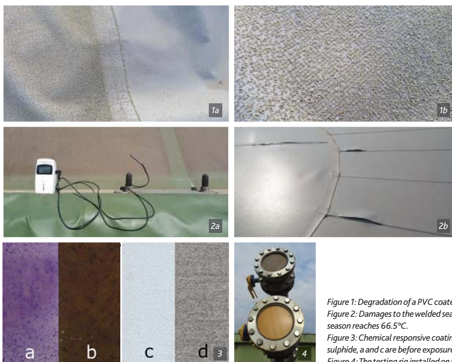
Figure 1: Degradation of a PVC coated polyester fabric due to the exposure to biogas.

For this reason, Maco Technology decided to involve one of his main clients in the biogas sector and validate the sensors on field through a pilot case. The brand new biogas plant is based in the Milan area and is designed to transform agricultural waste into fertilizers