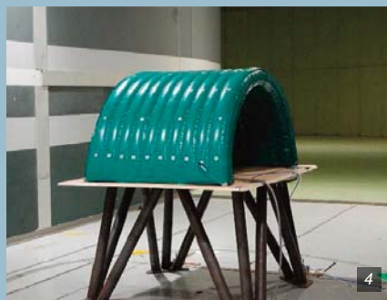
Figure 1: Inflatable shelter for solar impulse plane @Solar Impulse.