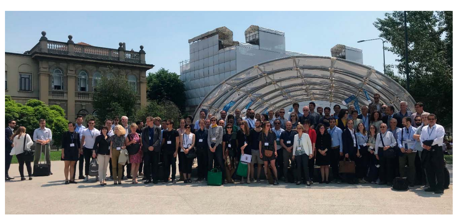
Group photo of the TensiNet Symposium 2019 participants in front of the TemporActive Pavilion

TensiNet Annual General Meeting &Partner Meeting 2/2019 | 08/10/2019 at 19.00 (during symposium Form and Force 2019)