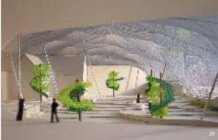
Figure 2a/b: Physical model of the aviary